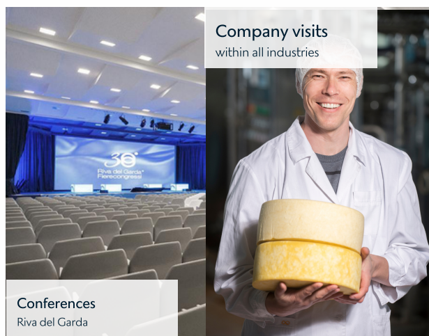
Company visits within all industries