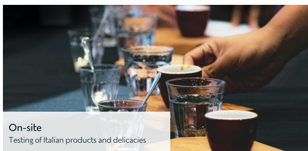
On-site Testing of Italian products and delicacies

A professional, competent and engaging collaboration "Our wishes and ideas for the trip were converted into relevant, inspiring and interesting meetings with Italian companies of the highest class. DANITACOM also took care of leisure activities, dinners and transport during the trip. It all worked!"