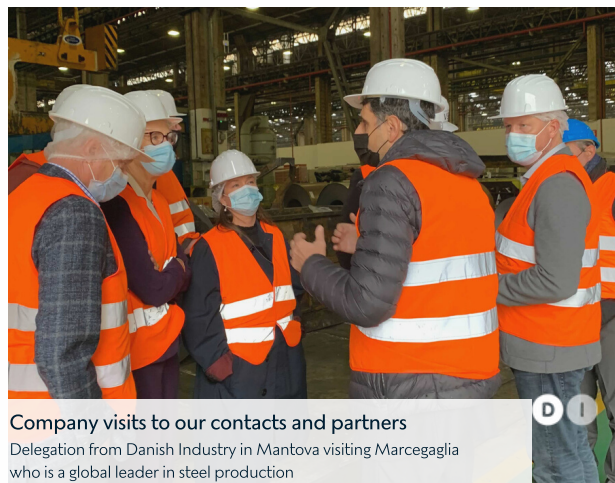
Company visits to our contacts and partners Delegation from Danish Industry in Mantova visiting Marcegaglia who is a global leader in steel production